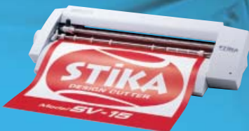
Model SV-15 340mm (15") Cutter

Create Colorful Custom Graphics with Ease